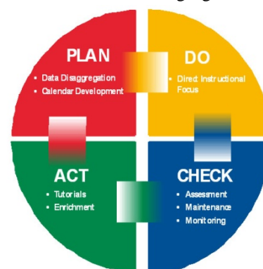
Figure 2. The PDCA Cycle from Edward Demings

It has been know that in relation to the process, TQM is based on the Deming's cycle called as PDCA (Plan-Do-Check-Act). The cycle can be seen from this following figure.