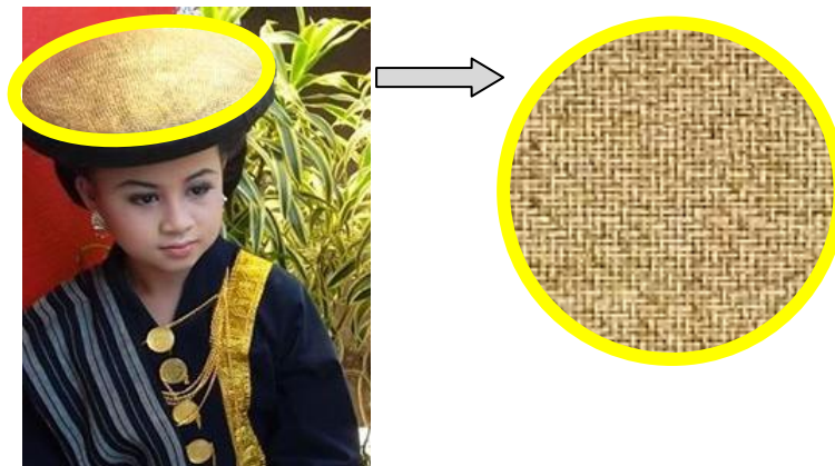
Figure 2. Caping kalo as a context

Caping kalo is one of Kudus cultural heritage. Caping in English is called hat. Caping kalo made of woven bamboo. Caping kalo used with Kudus traditional clothes and usually used into kretek dance performance. The surface of woven bamboo can be help to construct circle's attributes, like figure 2 below.