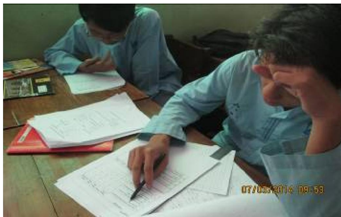
Picture 8. Students completed VLES questionnaire

The interview and pictures above show how students learn from dilemmas stories. Even some of them try to find alternative solutions to the use chemicals. This is a positive impact on student awareness for a healthier life. The results show that the students are interested and motivated to learn chemistry as it is related to daily lives. Students also learn to understand and reflect on their values. Students learn to cooperate with others share and negotiate their ideas for solving problems on dilemmas presented. Dilemmas stories from this study are represented on the booklets and dilemmas stories weblog . The front page booklet dilemmas stories can be seen in Figure 9, whereas weblog address is http://chemistrydilemmas.wordpress.com/