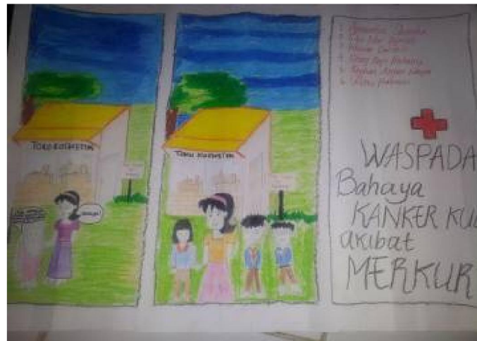
Picture 7. Students Poster on Mercury Dilemma