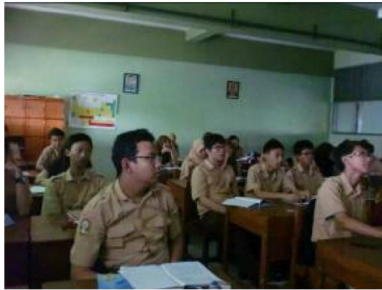
Picture 2. Students listen the story