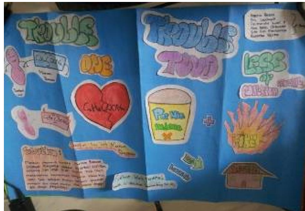
Picture 5. Students Poster on Sodium Benzoat Dilemma