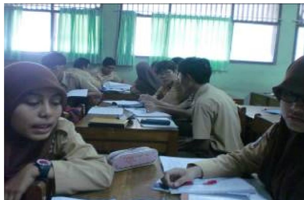
Picture 4. Students discussion in group for solving the problems