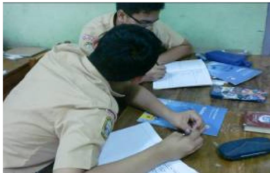
Picture 3. Students discussion in pair