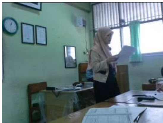
Picture 1. Teacher reads the story

There some pictures of dilemmas stories teaching. Students created the poster as the results of their reflections on dilemmas stories teaching: