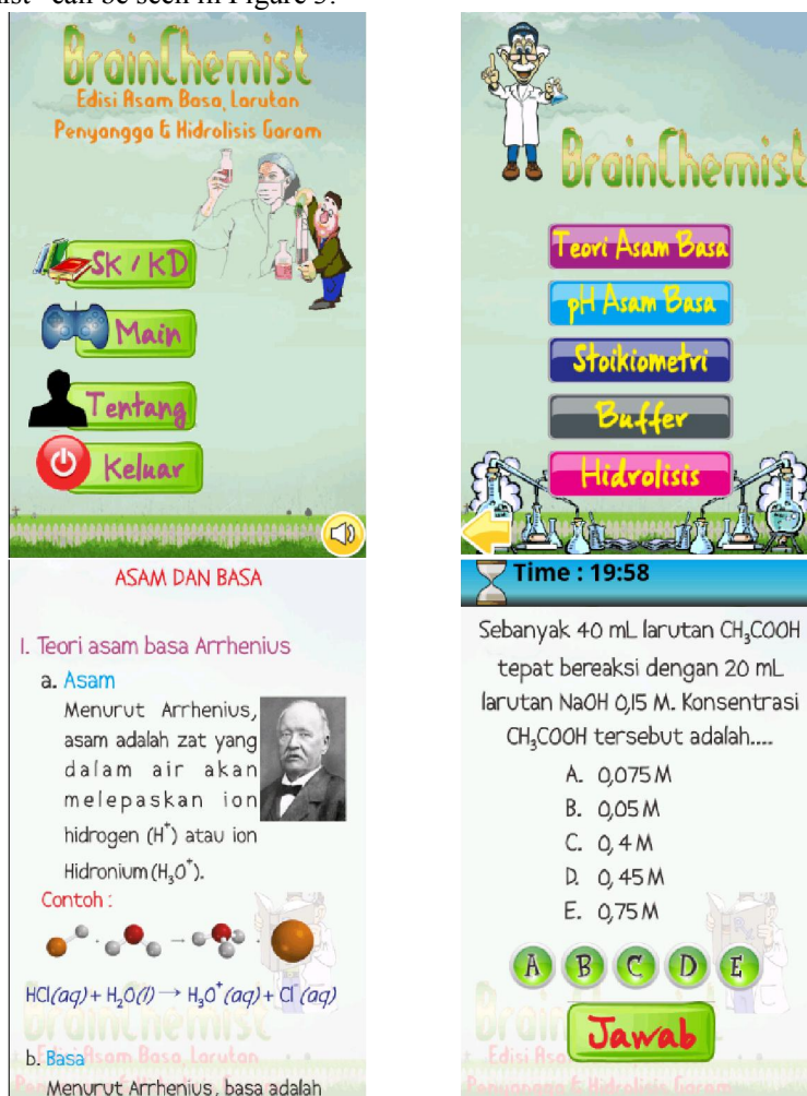
Figure 3. Screenshoot matter of media

The product of this research is mobile game "Brainchemist" which has a minimum specification devices to run on android based mobile phone, operating system Android Froyo 2.2, 256 Mb RAM, and 600MHz processor. File size of mobile game "Brainchemist" of 15 MB can be installed on an external mobile phone memory. Example of display in a mobile game "Brainchemist" can be seen in Figure 3.