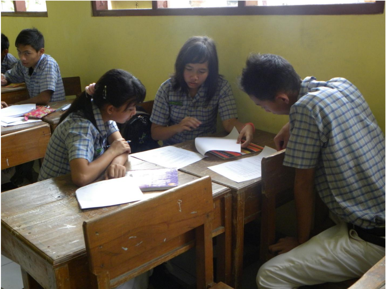
The students did a group discussion activity.