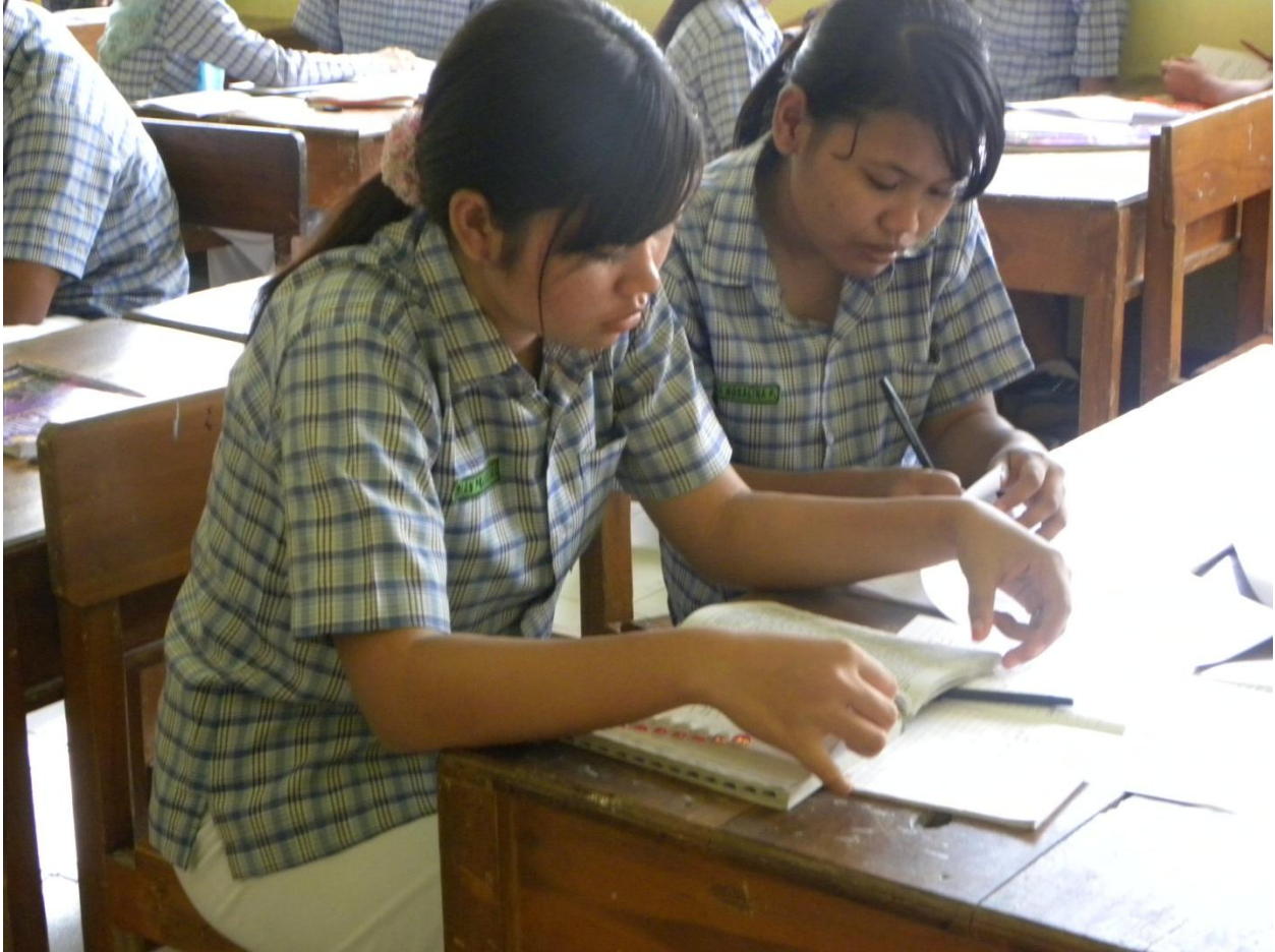
One of the students checked her dictionary while the groups were discussed.