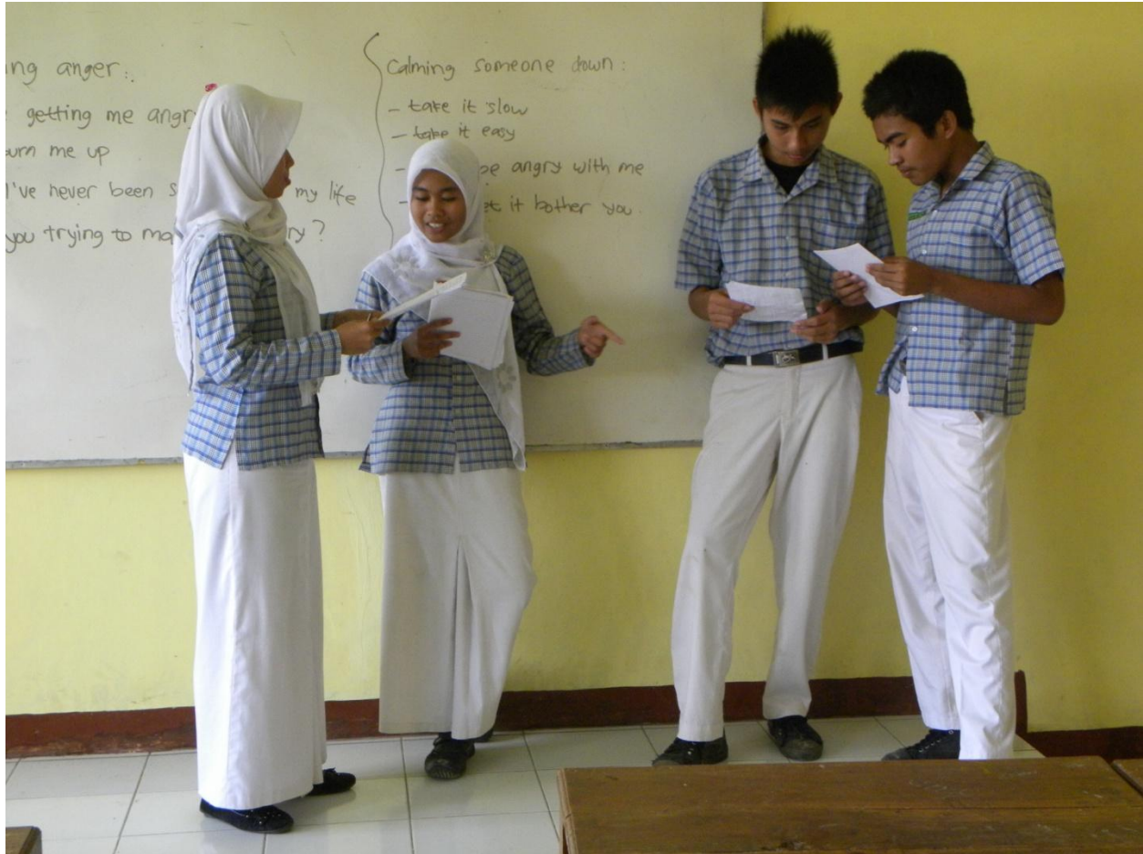
The students did a role play. The situation was about expressing anger.