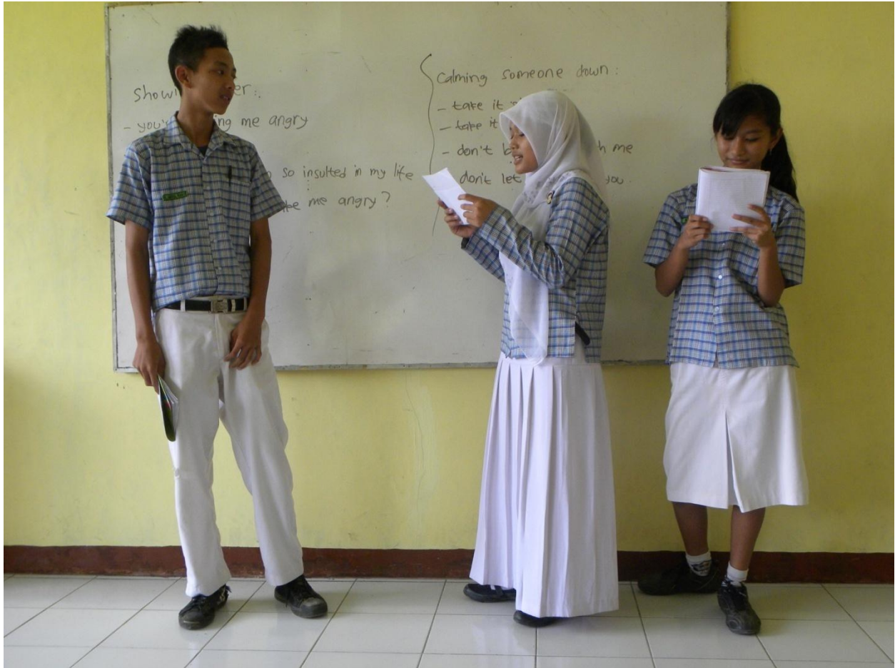
The groups act out in front of the class.