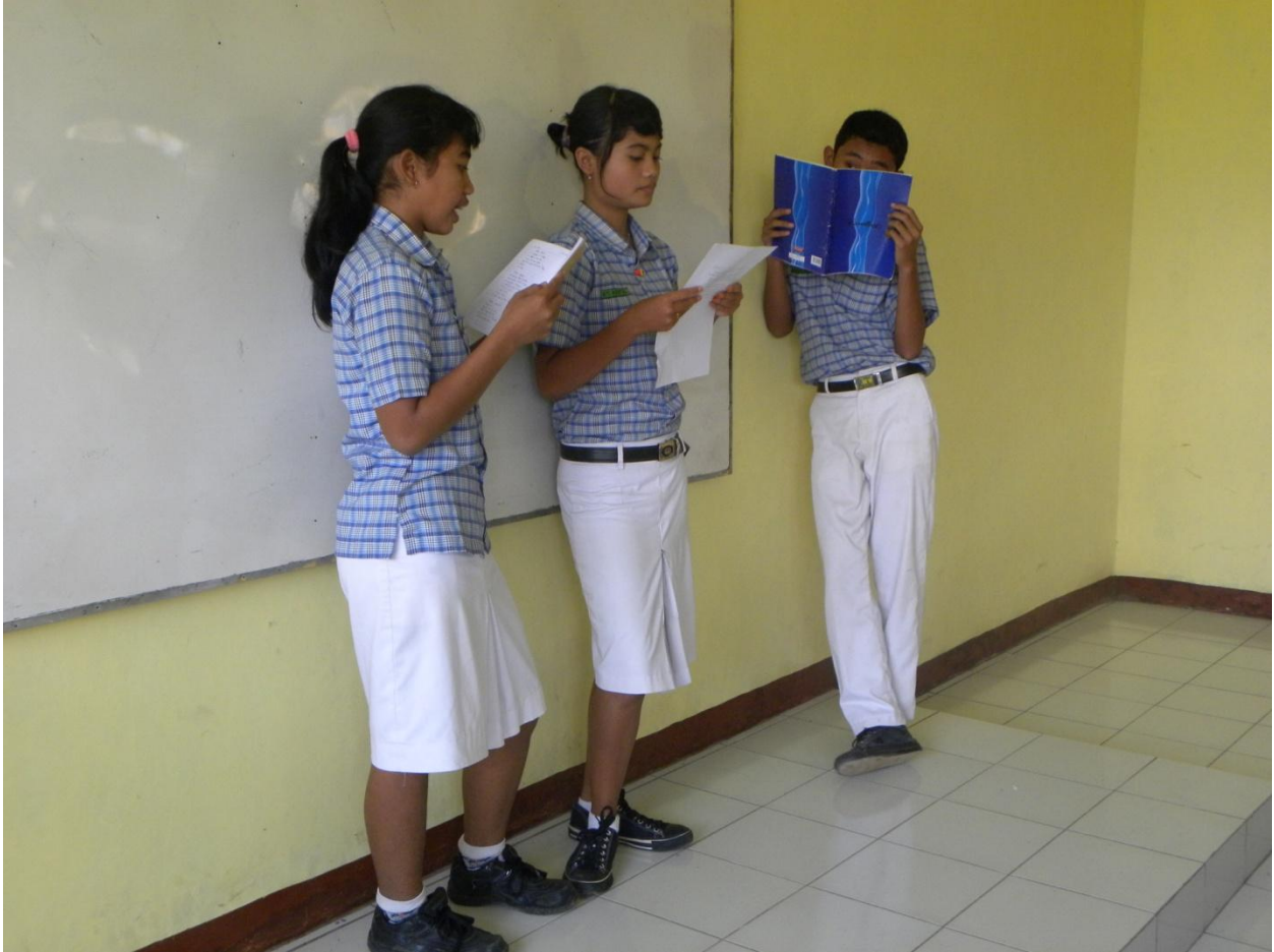
The students act out the scripted role play in front of the class.