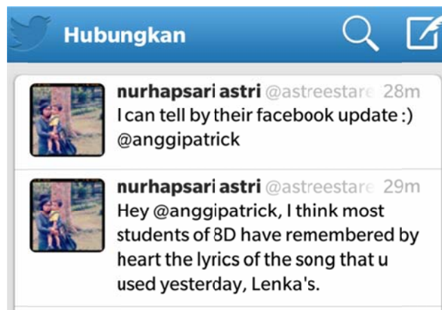
Figure 6 The teacher shared some comments about the effectiveness of missing lyrics song.

It can also be seen from the sample of students' listening test below.