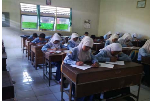
Figure 5 The Students fill missing lyrics song sheet individually