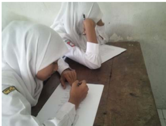
Figure 2 The students did missing lyrics songs sheet individually

Before the researcher ended the class, he summarized the lesson to students. After that, the researcher previewed to the next material. Then, the researcher ended the class by saying good bye to the students.