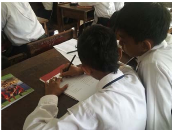
Figure 3 The students are enthusiastic in doing the tasks cooperatively

In addition, the weaknesses dealing with the researchers' technique, these are the songs were too fast and unclear; the speakers and asked students reading the lyrics first, can be seen in the following interview transcript: