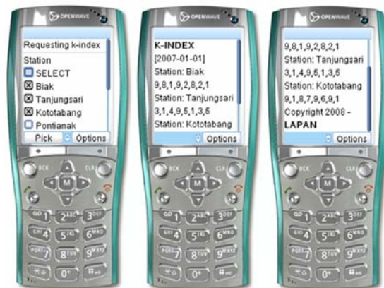
Figure 5. An example of query results in requesting k index for multiple stations on January 1 st , 2007.

Services related to ionospheric anomaly are GPS correction and scintillation. LAPAN has GPS receiver dedicated to research and its applications located at Bandung and Pontianak. Using these GPS data, it is possible to monitor condition of ionosphere. If there is anomaly, an alert can be uploaded to WAP server so that the users can browse information via a mobile phone.