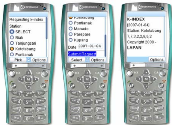
Figure 4. An example of query result in requesting k index from Kototabang station on January 4 th , 2007.