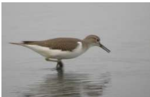
Figure 4. Actitis hypoleucos

This species included in the family of Scolopacidae and the genus Actitis . Actitis hypoleucos known as Sandpipers, a species of waterbird eats crustaceans, insects and other invertebrates that live in sand habitats, mud and estuaries. Results of the analysis of mercury in the kidneys of Actitis hypoleucos 0,19 ppm, liver 0,18 ppm, and the muscles 0,10 ppm. (see Fig.4).