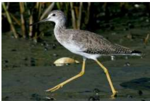
Figure. 3 Tringa melanoleuca