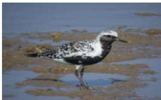
Figure 5. Pluvialis squatarola

This species known as a big pot included in the family of Charadriidae and genus pluvialis . This waterbird eats invertebrate in muddy and sand habitat in the tidal area, usually foraging in small groups. Based on the result of laboratory analysis, that the exposure of mercury in the kidneys of Pluvialis squatarola 0,11 ppm, liver 0,10 ppm, and the muscles 0,10 ppm. (see Fig.5).