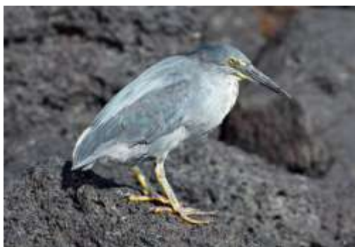
Figure. 2 Butorides striatus

This species included in the family of Ardeidae and genus of Butorides , the local name known as Kokokan (local name: Tou). This birds eats the fish, insects, and shrimp in coastal habitats, estuaries and ponds. Usually, this species fly foraging alone, sitting on a rock or the edge of the embankment of water while waiting for prey. Based on the analysis of mercury obtained in the kidneys of Butorides striatus that is 0,22 ppm, liver 0,17 ppm, and muscle 0,12 ppm. (see Fig.2)